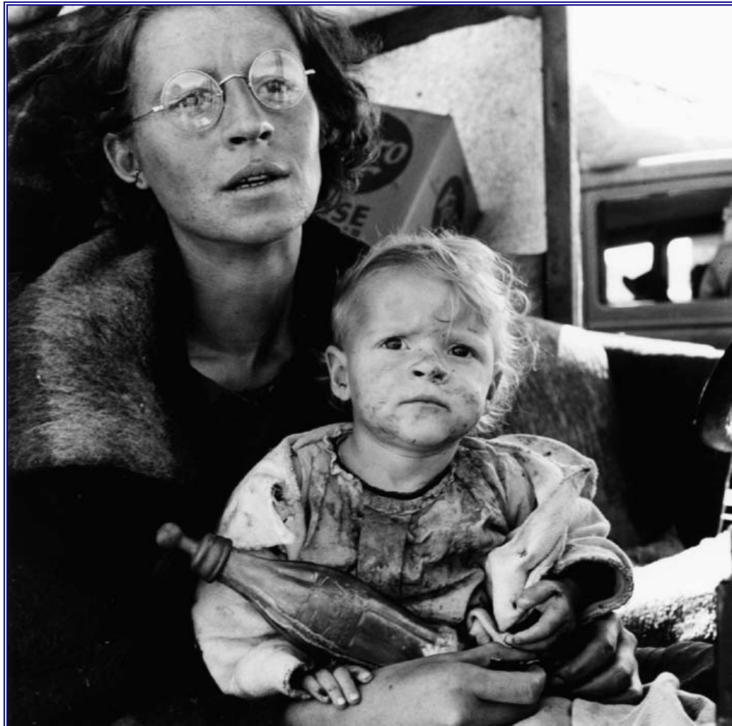
Dorothea Lange, September 1939.