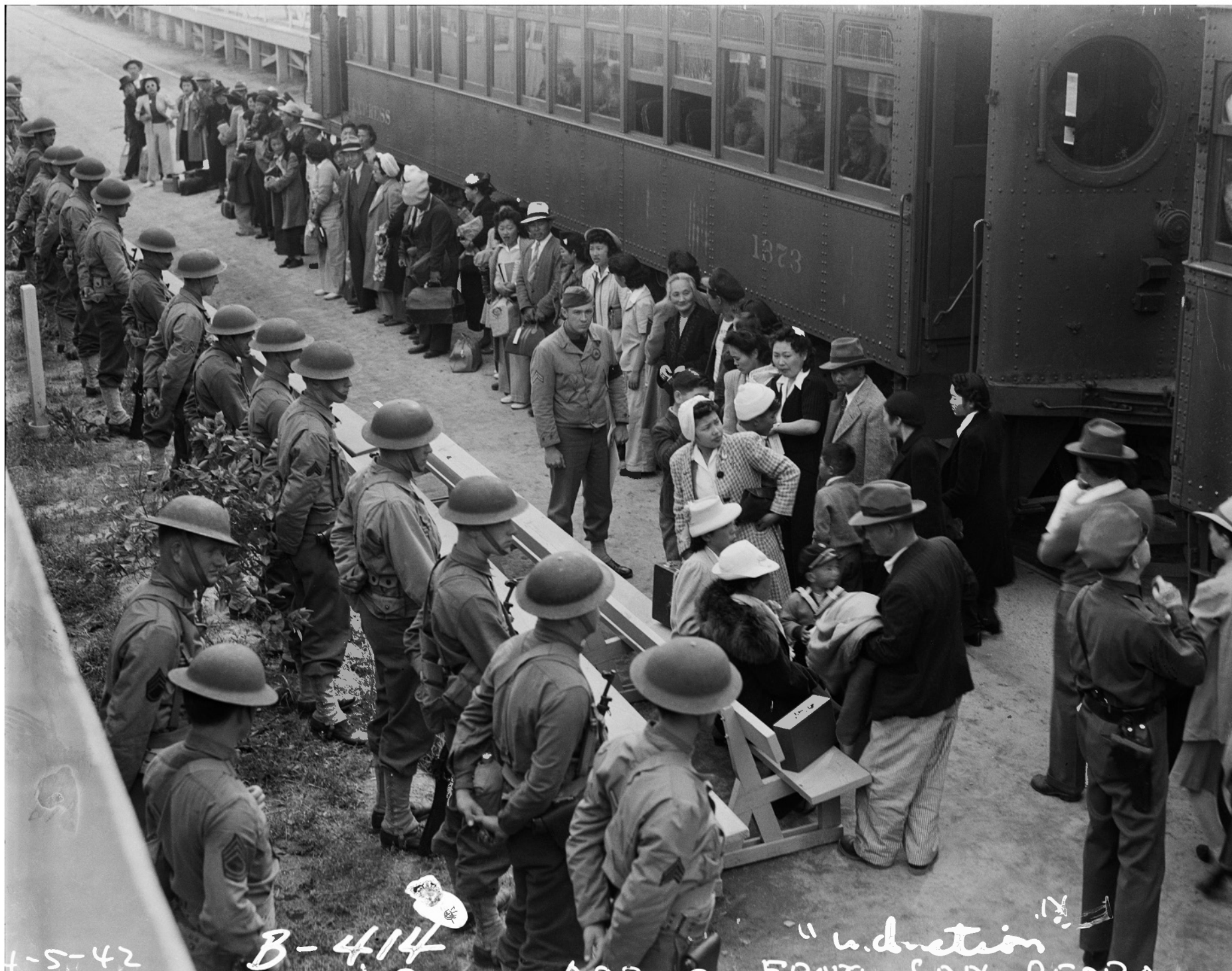
4-5-42 B-414 "induction" 14 FROM CAMP A-100 "Evacuees" arrive under guard at the Santa Anita Assembly Center. Clem Albers April 5, 1942