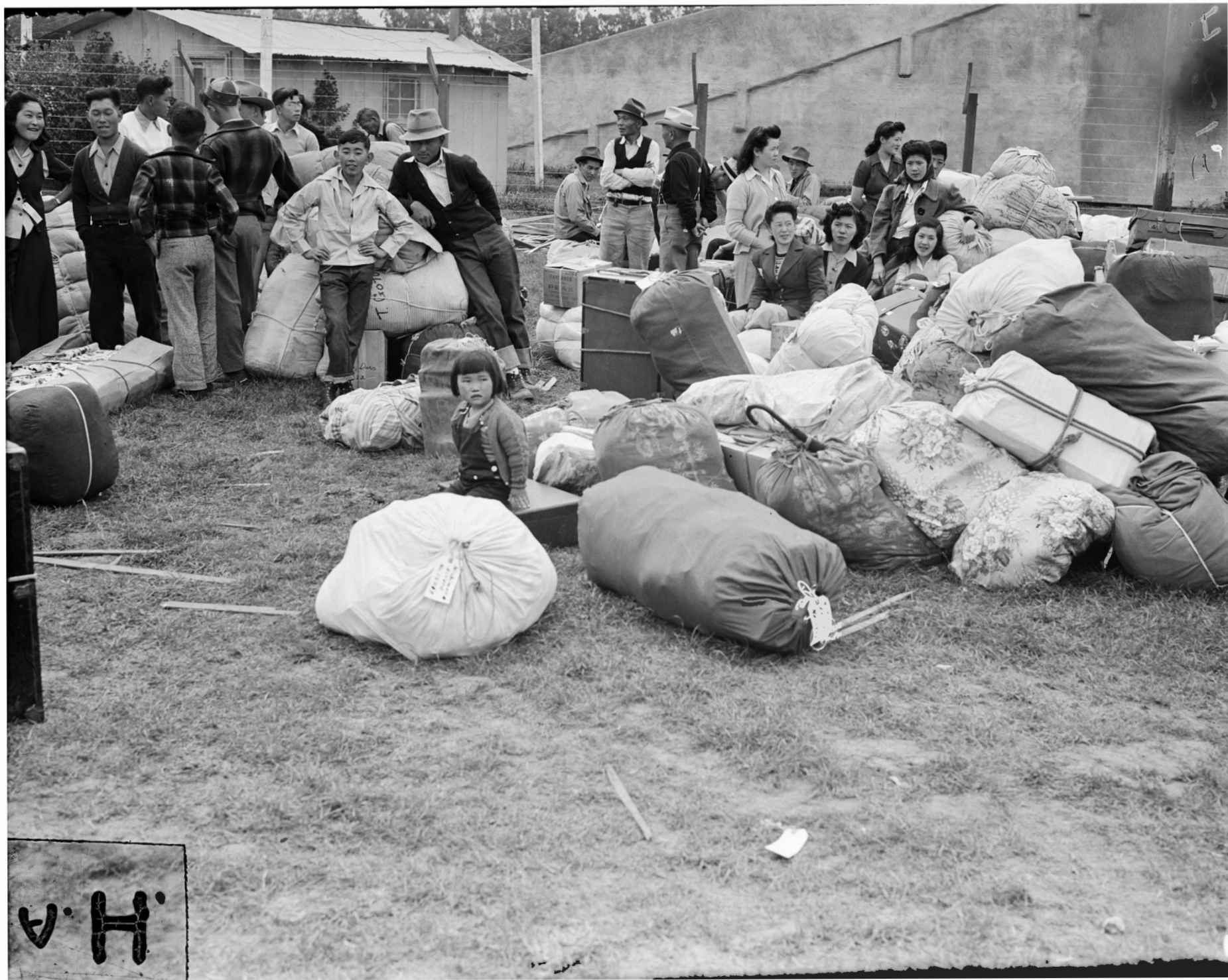
Newly arrived families search for their possessions amid piles of baggage unloaded from trucks at the Salinas Assembly Center. Clem Albers March 31, 1942