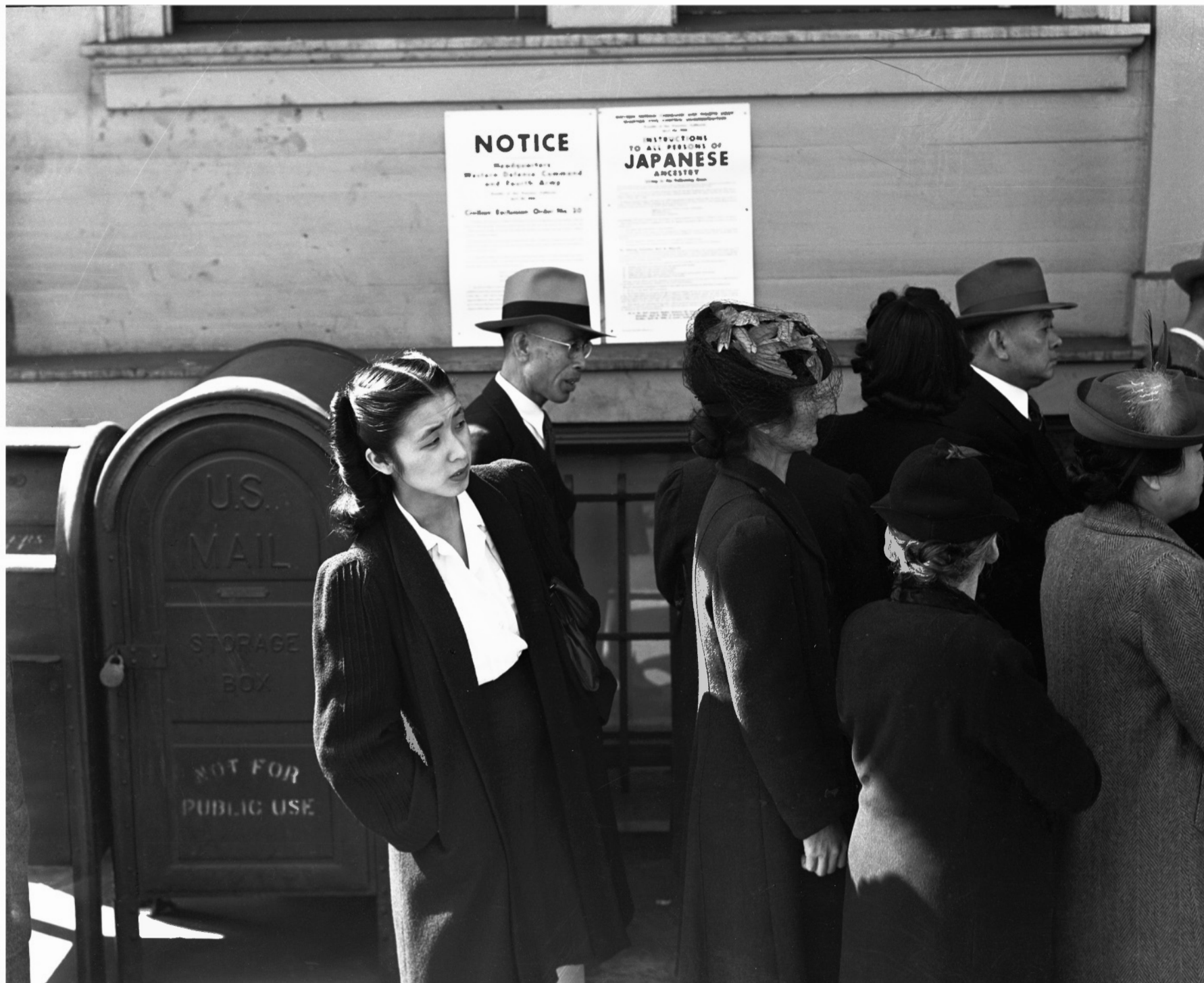
Anxious residents wait outside a "civil control station" in San Francisco where they will be given instructions for their "evacuation day." Dorothea Lange April 25, 1942