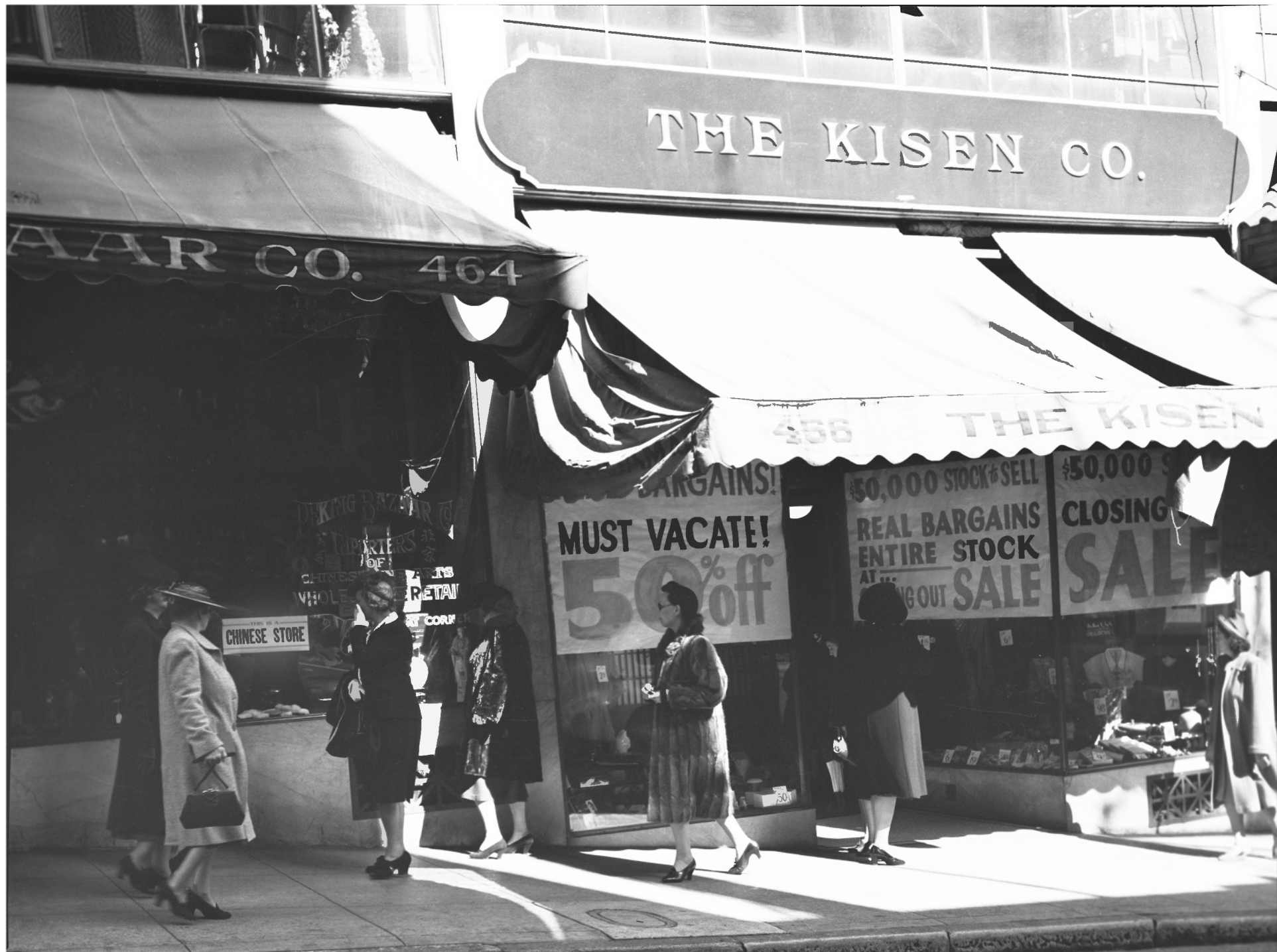
Business owner in San Francisco advertises a half-price sale prior to his "evacuation." April 4, 1942