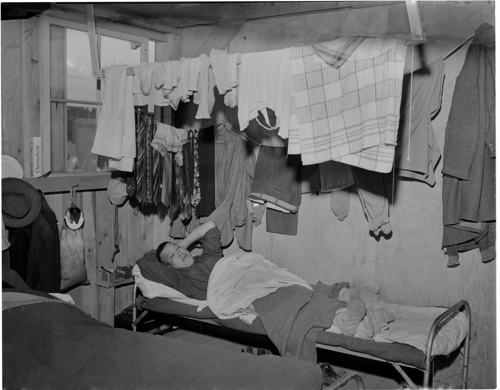
A new arrival in his living quarters at the Manzanar camp. April 2, 1942