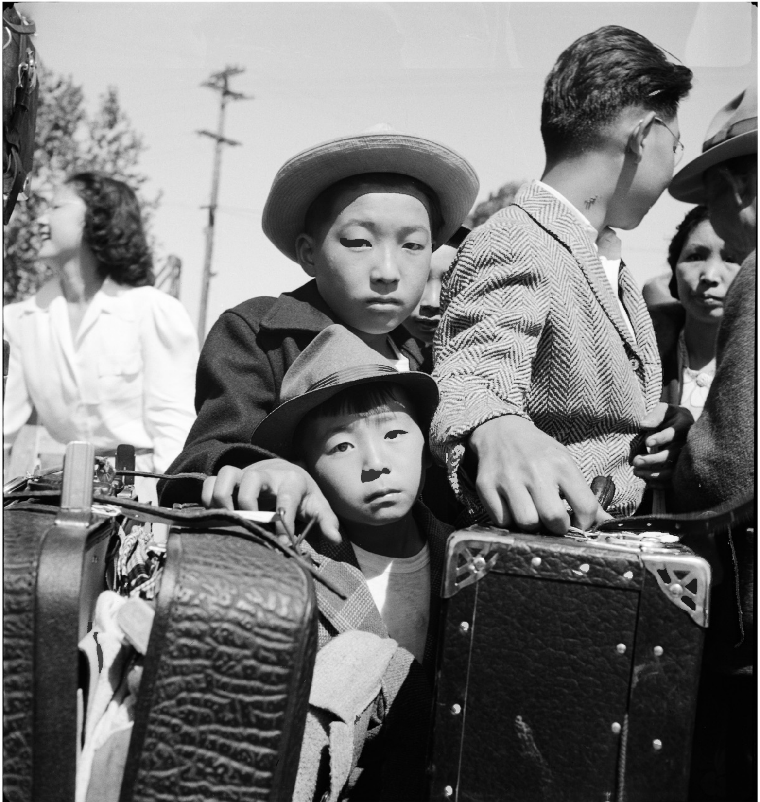
Young “evacuees” wait for their baggage to be inspected upon arrival at the Turlock Assembly Center. Dorothea Lange May 2, 1942