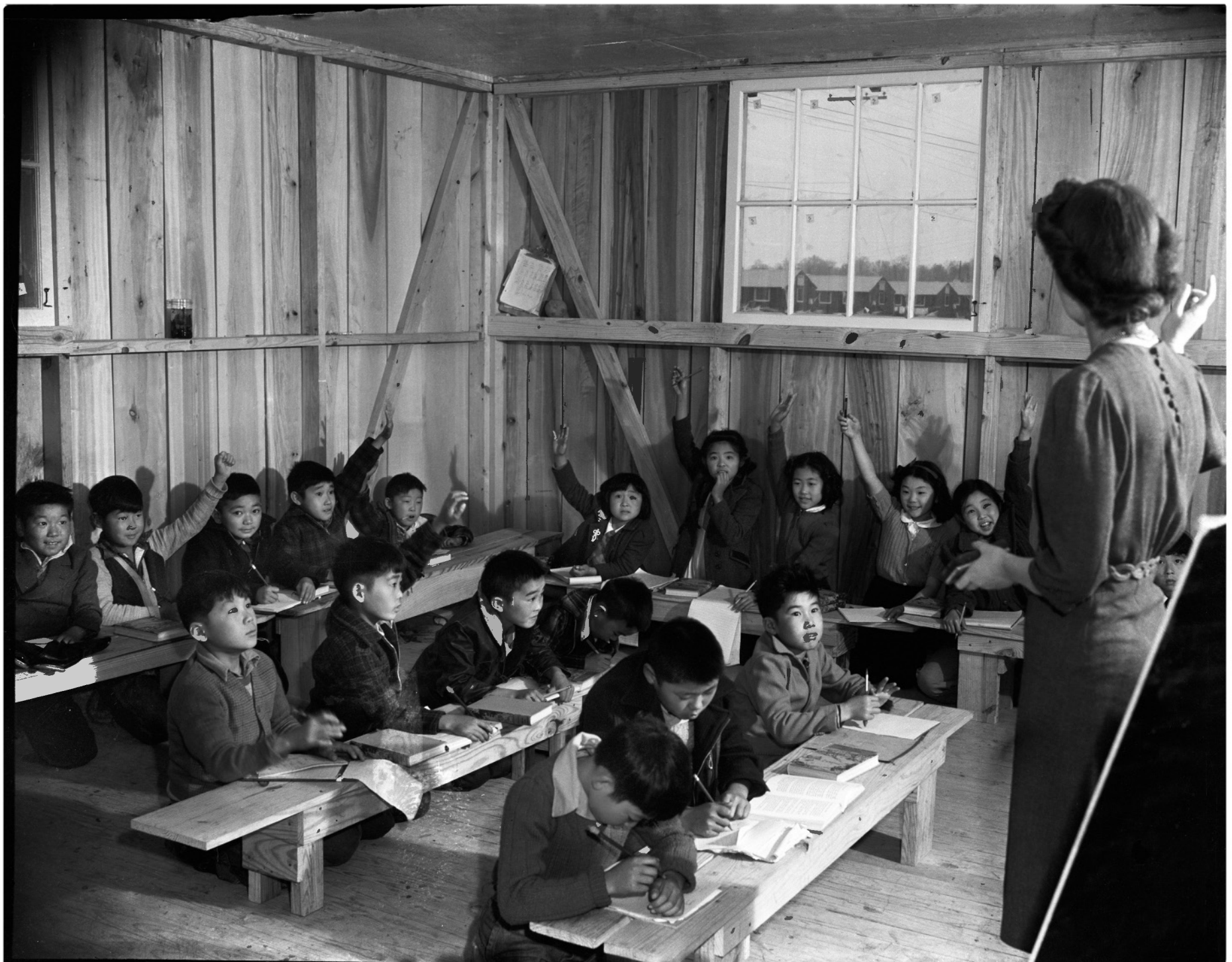
Primary and secondary schools were established in all of the camps. This third grade class was part of the school at the Rohwer Relocation Center in Arkansas.