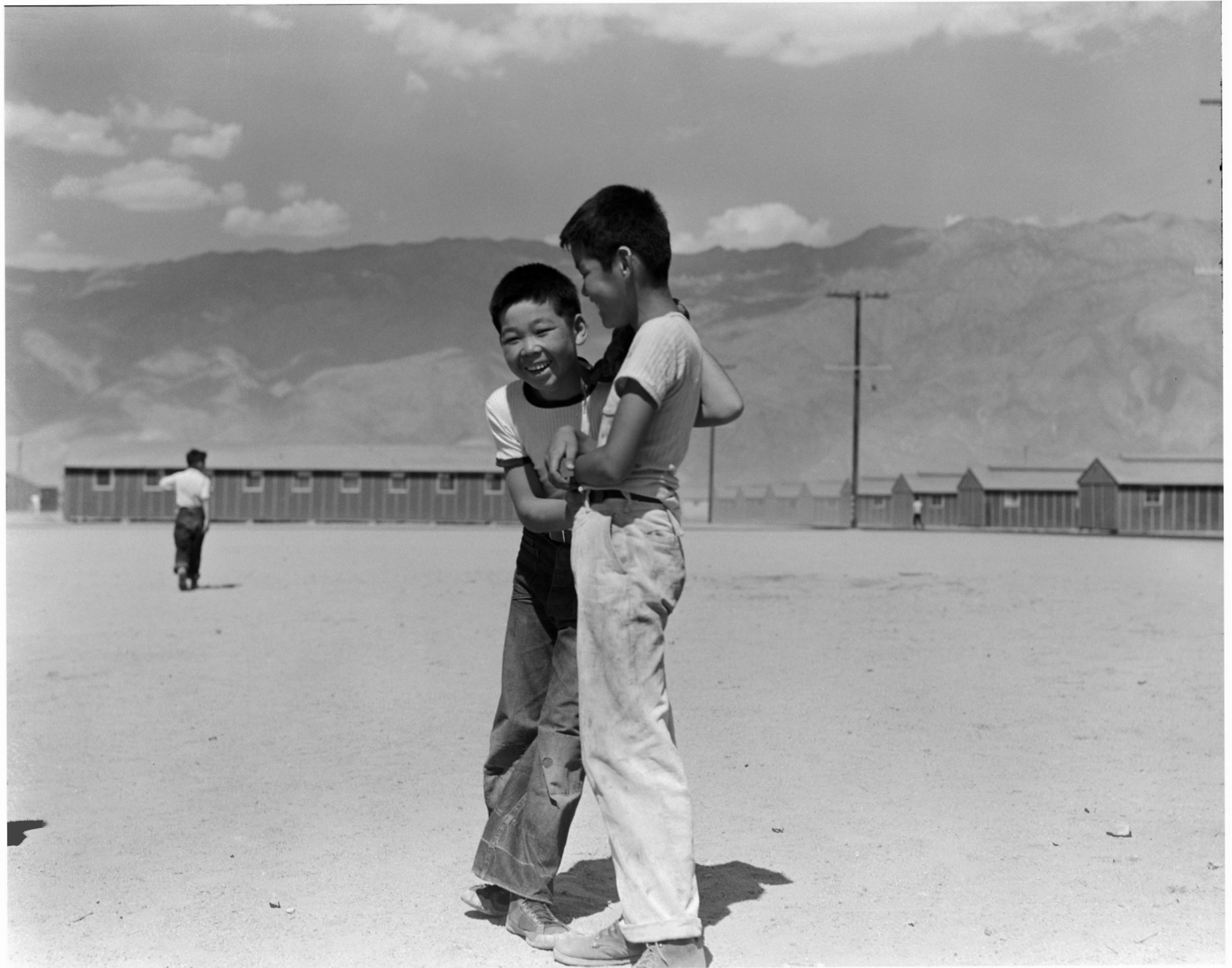
Boys on a windswept field at the Manzanar Relocation Center. Dorothea Lange July 2, 1942