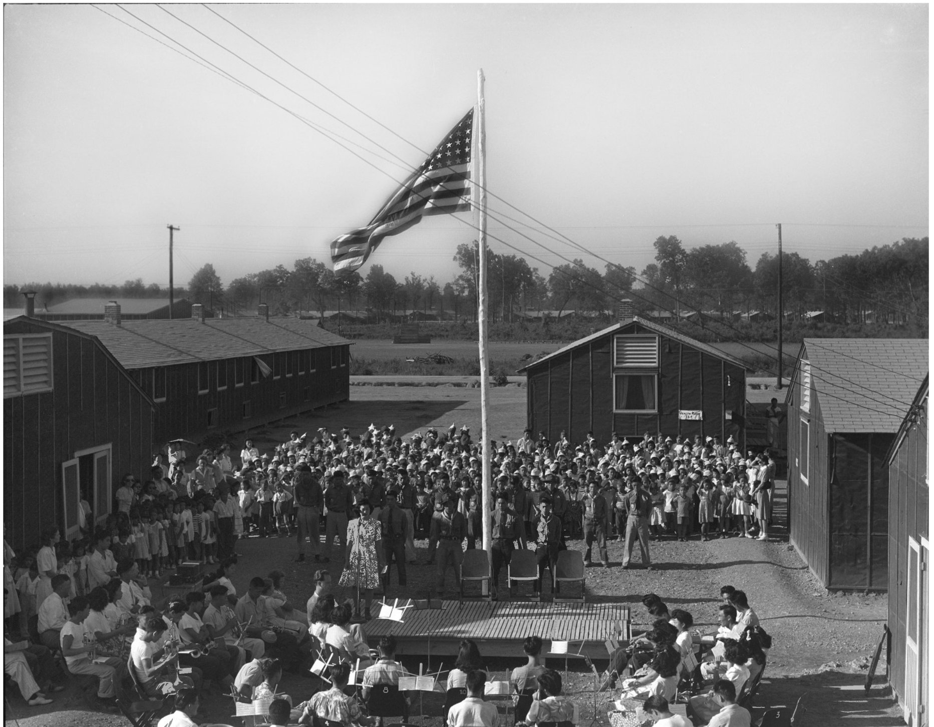
Flag raising ceremony performed during a three-day July 4th celebration at the Rohwer Relocation Center in Arkansas. Fred Yamaguchi July 5, 1943