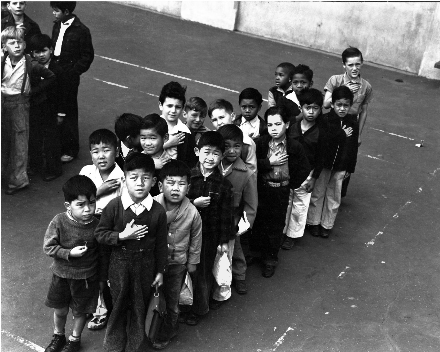
Children pledge allegiance to the flag at the Raphael Weill Public School in San Francisco. April 20, 1942