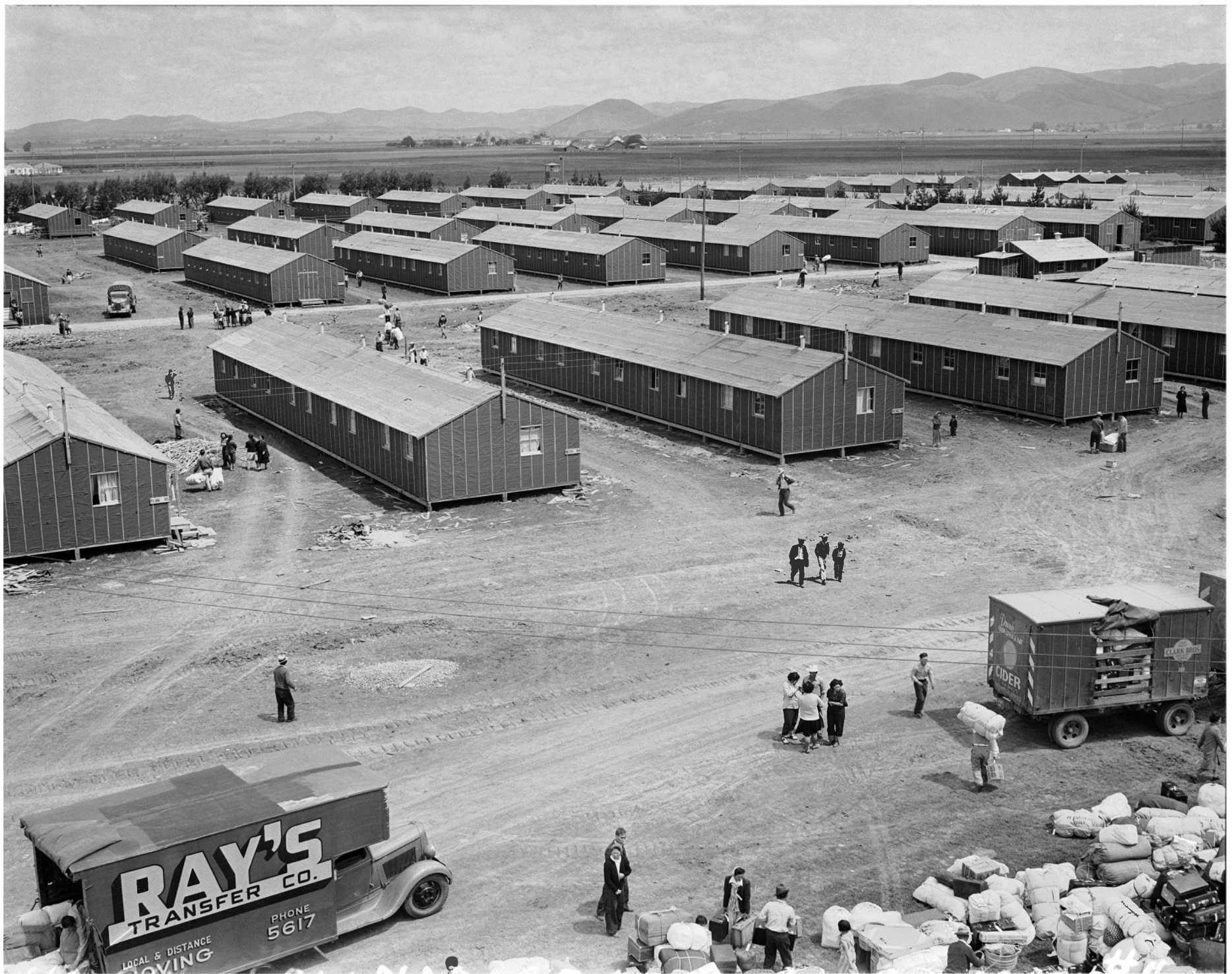
View of the barracks at the Salinas Assembly Center. In the foreground, baggage belonging to "evacuees" is being unloaded from trucks. Clem Albers April 29, 1942