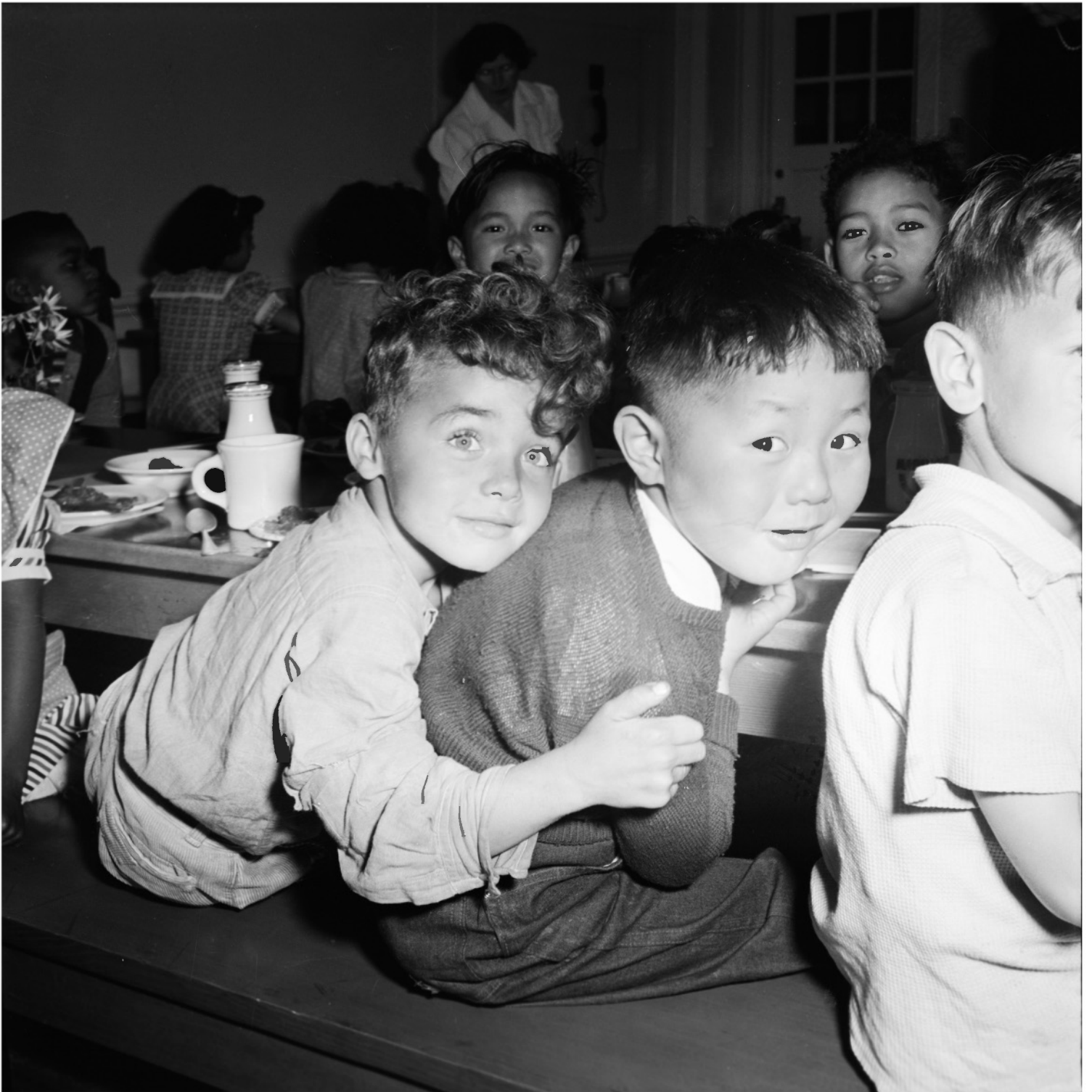
Lunch hour at the Raphael Weill Public School in San Francisco, California. April 17, 1942