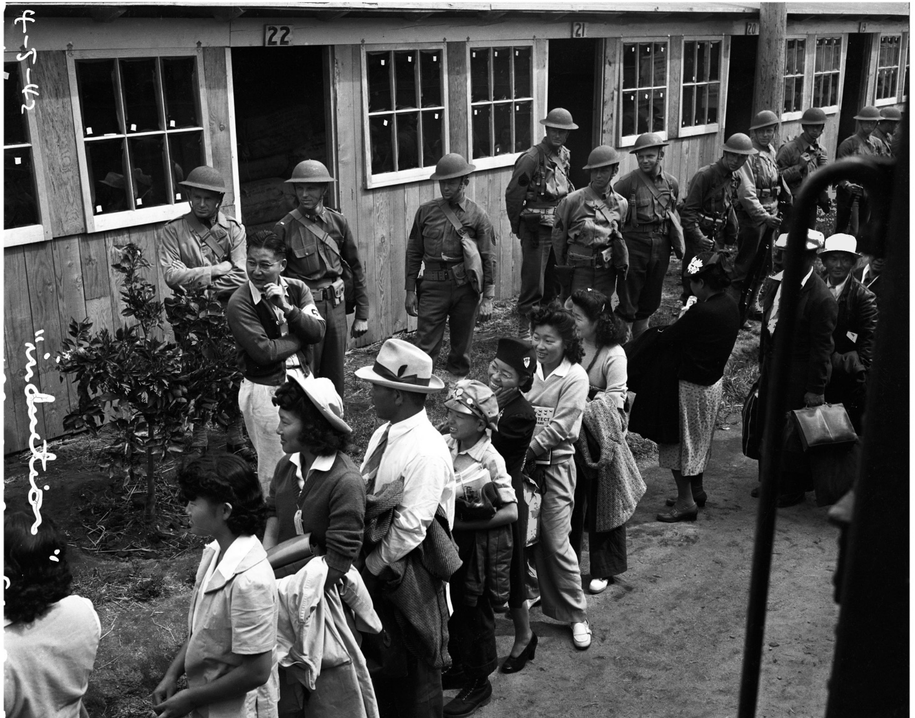
New arrivals form a line at the Santa Anita Assembly Center. Clem Albers April 6, 1942