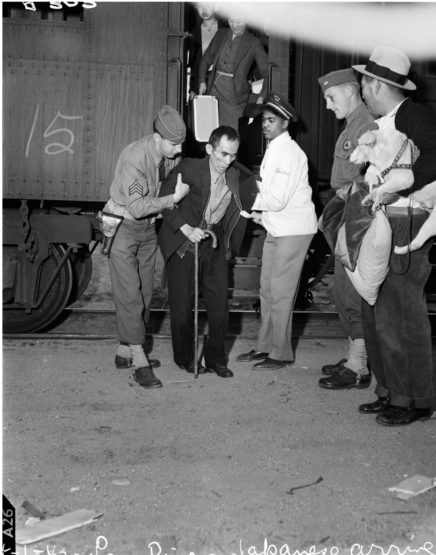
Soldiers assist a blind man and an infirm man as they exit an "evacuation" train in Lone Pine, California. The men will soon board a bus for a short drive to an "assembly center." Clem Albers April 1, 1942