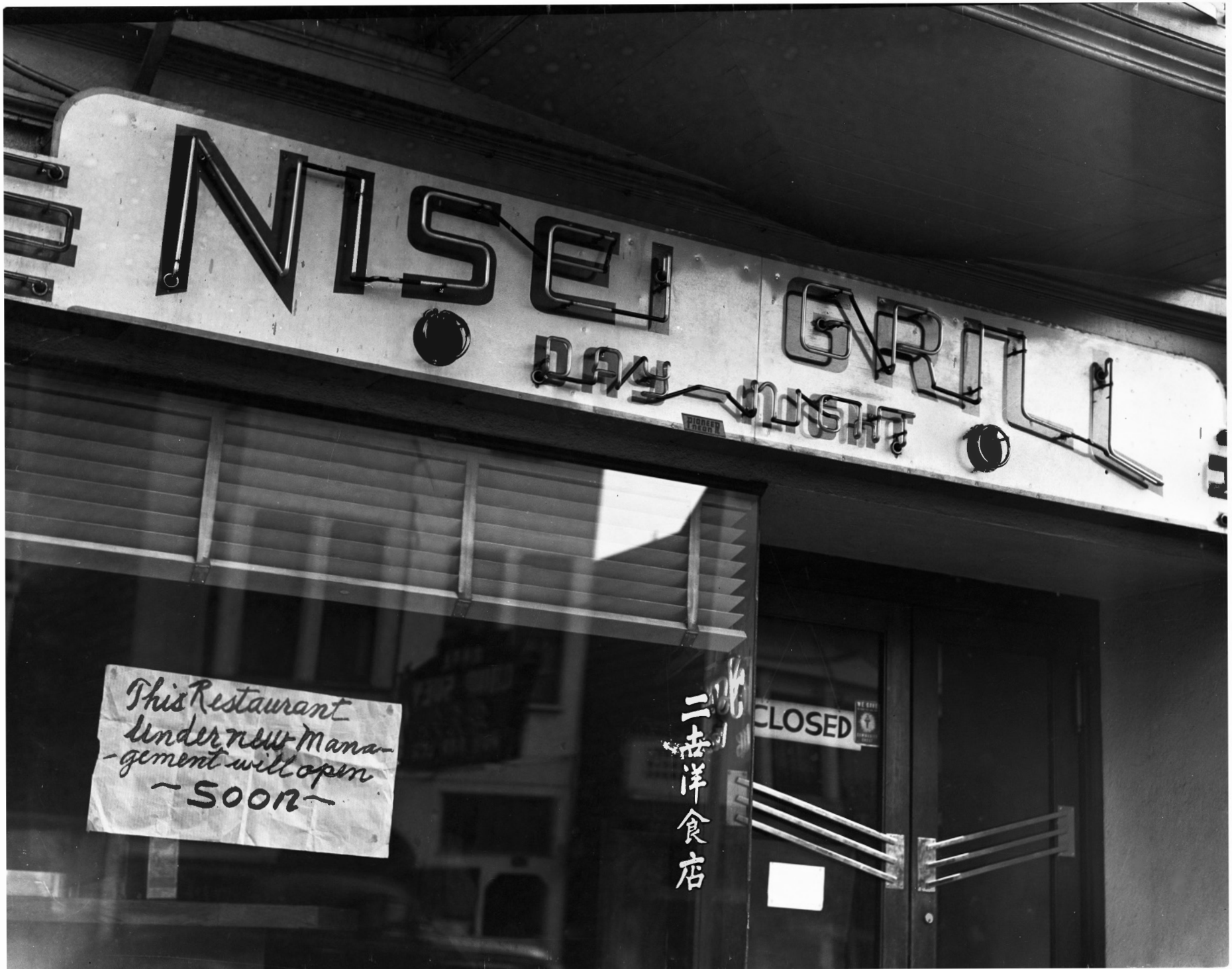
Sign publicizing "new management" outside a San Francisco restaurant sold by a Japanese American owner facing "evacuation." Dorothea Lange April 7, 1942