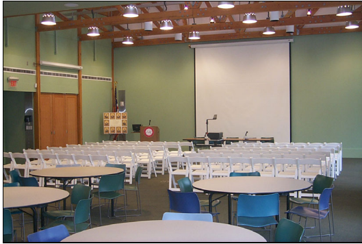
Custom set-ups are available in the multipurpose rooms.

In addition to visitor amenities, the education and conference center offers exceptional meeting and conference space. Audio-visual equipment is available upon request.