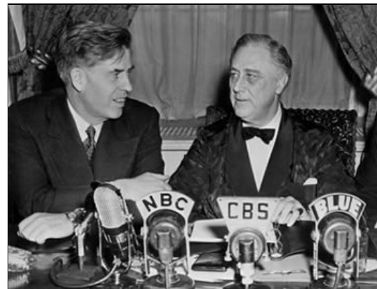
Henry Wallace and FDR during a radio broadcast at the White House in 1942.