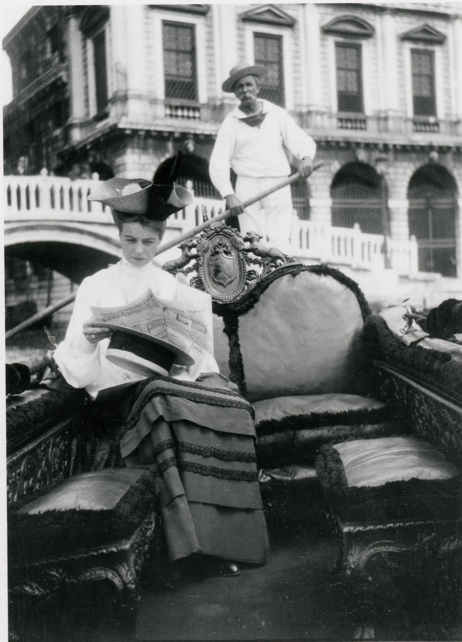
Eleanor Roosevelt in a gondola in Venice, Italy on the last day of her honeymoon. Photo by FDR, July 7, 1905. FDR Library Photograph Collection, NPx 47-96:4927(8)