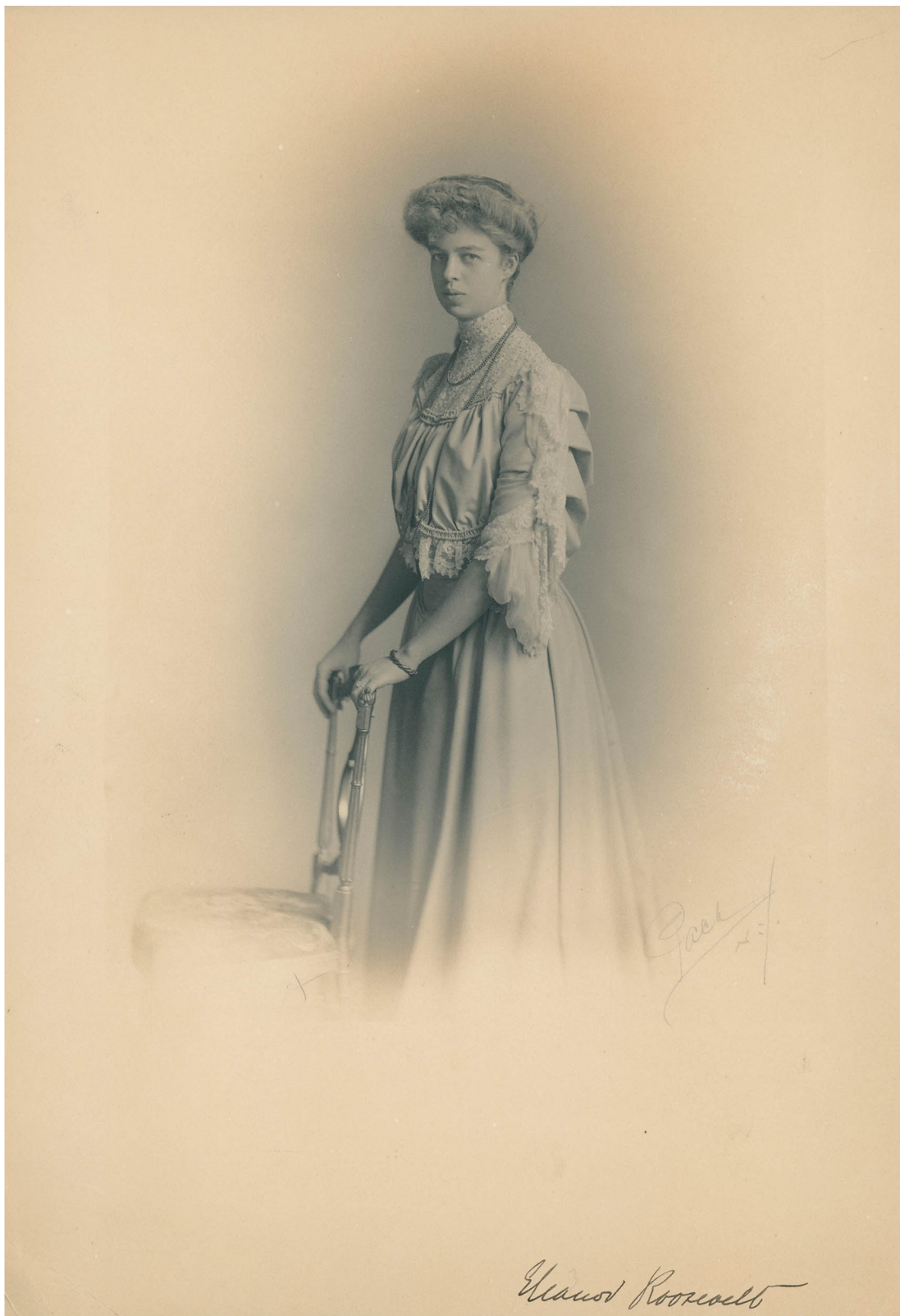
Formal portrait of Eleanor Roosevelt, 1904. FDR Library Photograph Collection, NPx 58-271