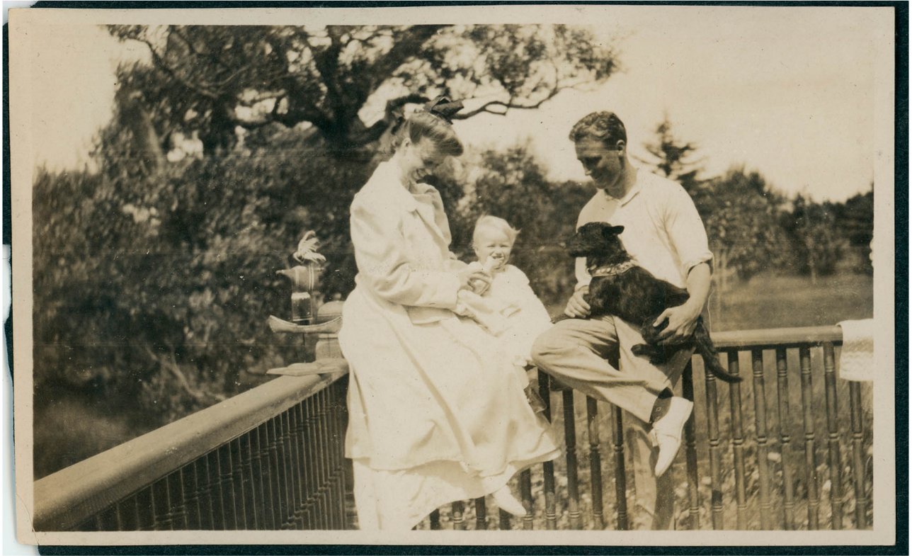
Franklin and Eleanor Roosevelt with baby Anna and Duffy at Campobello, 1907.