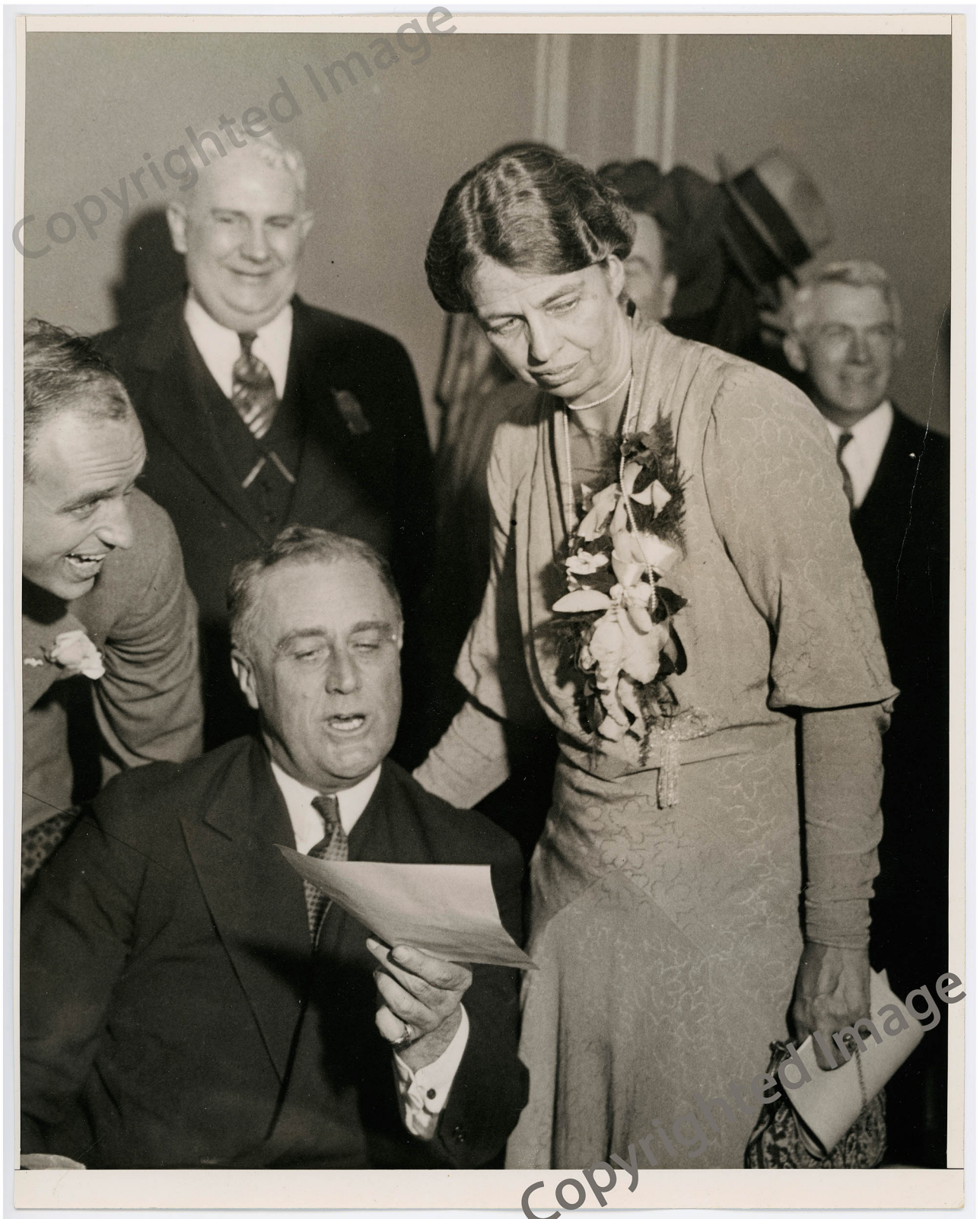
Franklin D. Roosevelt reading his victory telegram to Eleanor and James Roosevelt on Election Night at the Democratic Headquarters at the Biltmore Hotel in New York, NY, November 8, 1932.