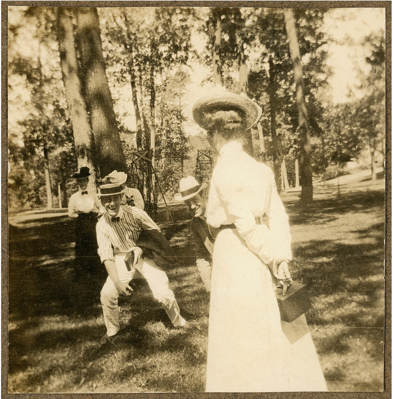
Franklin D. Roosevelt and Eleanor Roosevelt at "Steen Valetje," the Delano home in Barrytown, NY, 1902.