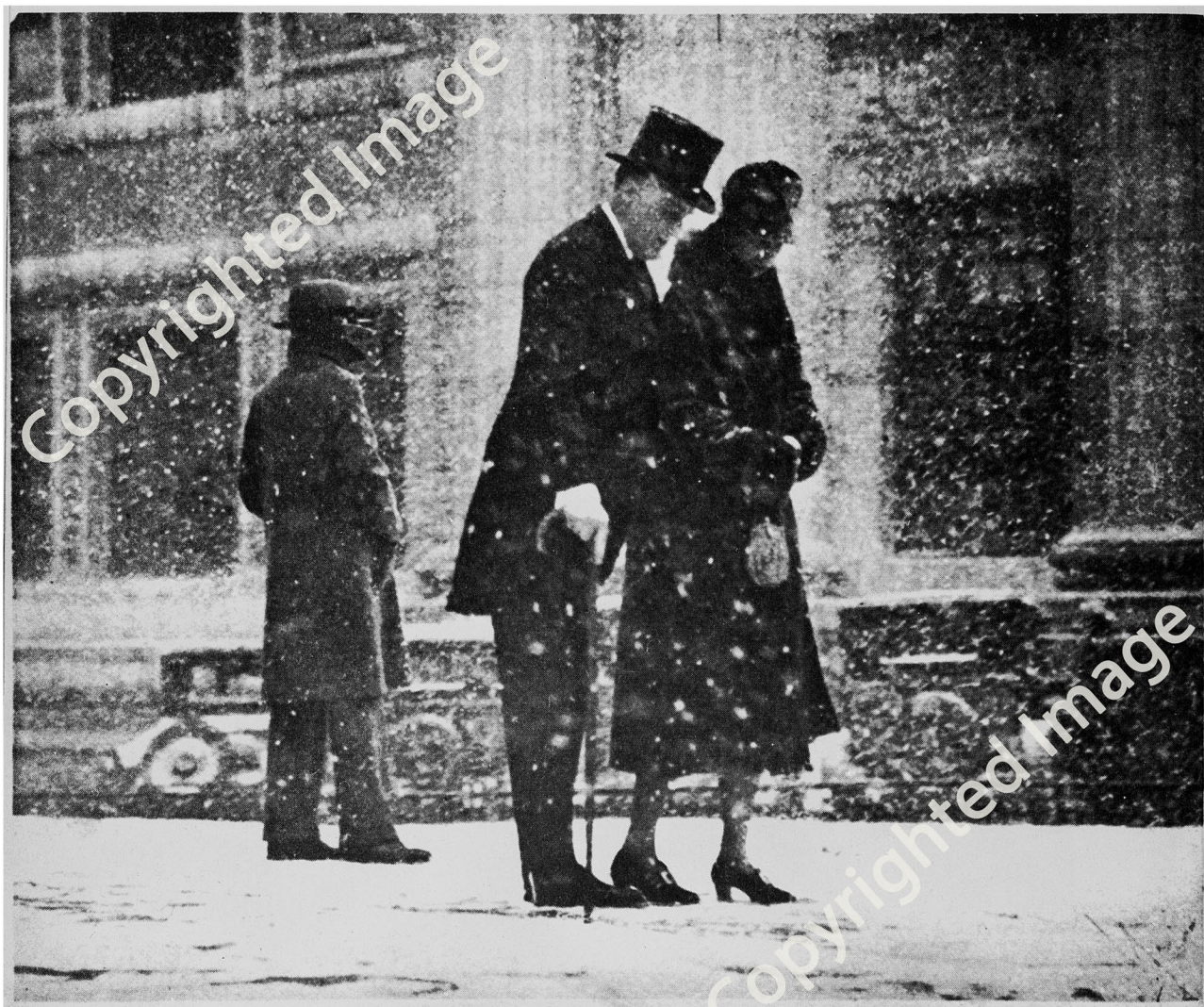
Franklin and Eleanor Roosevelt leaving church services in Albany, NY, January 6, 1929. FDR Library Photograph Collection, NPx 81-51. Copyright: Knickerbocker News.