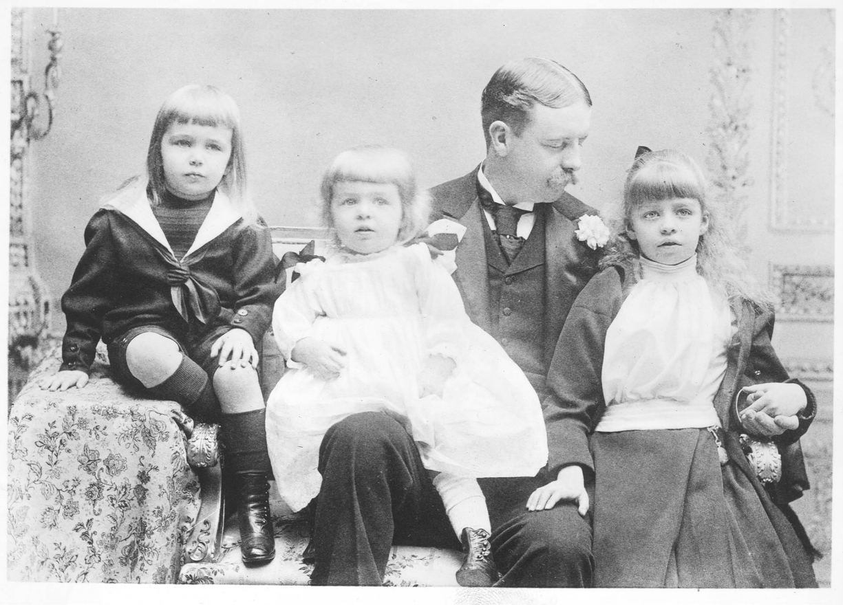
Portrait of Eleanor Roosevelt with her father Elliott and brothers, 1892.