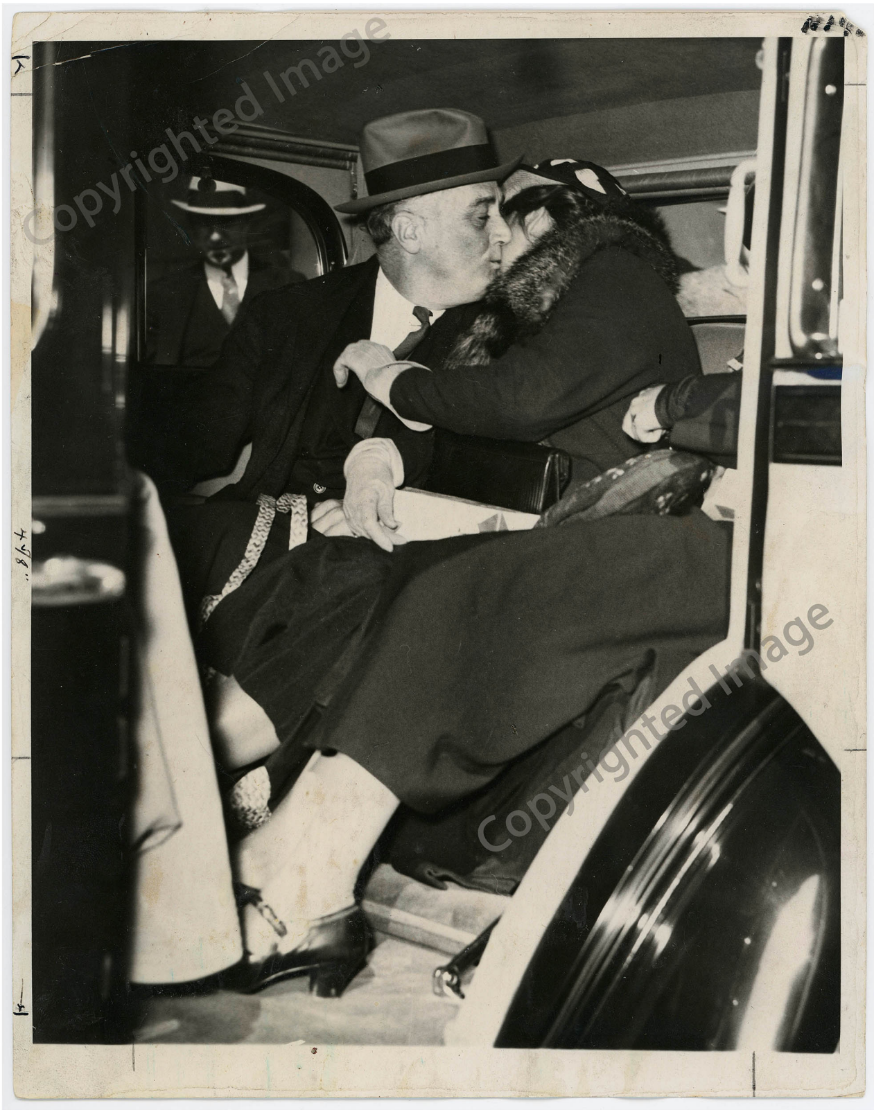
Franklin D. Roosevelt welcomes home Eleanor Roosevelt upon her return from Puerto Rico and the Virgin Islands, March 17, 1934.