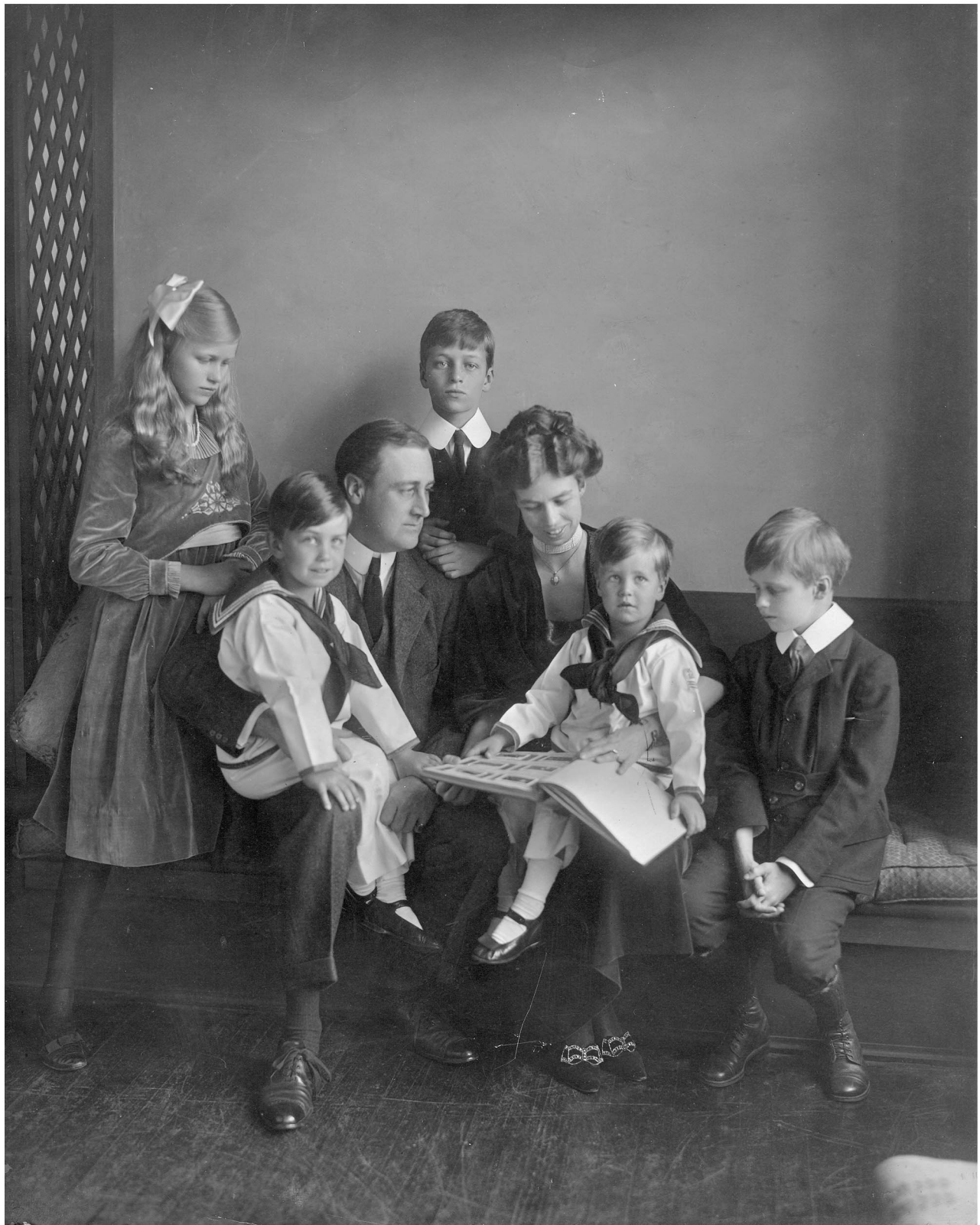
Franklin and Eleanor Roosevelt with their five children in Washington, DC., June 12, 1919